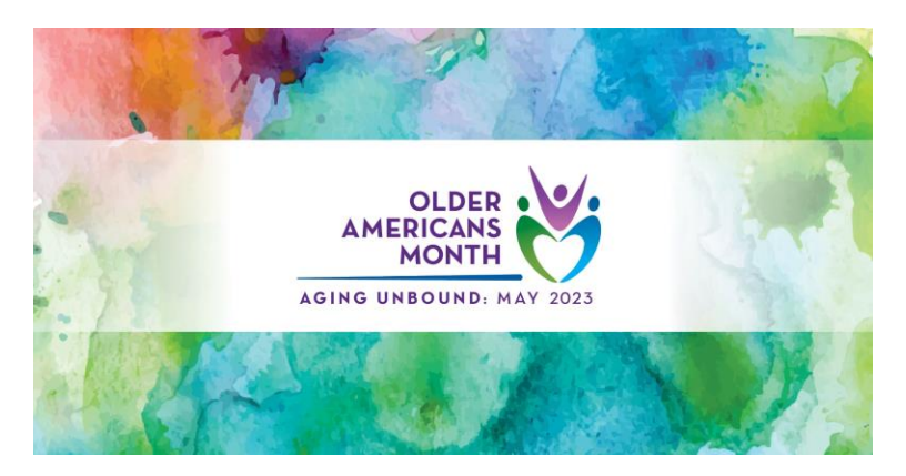
Information provided by